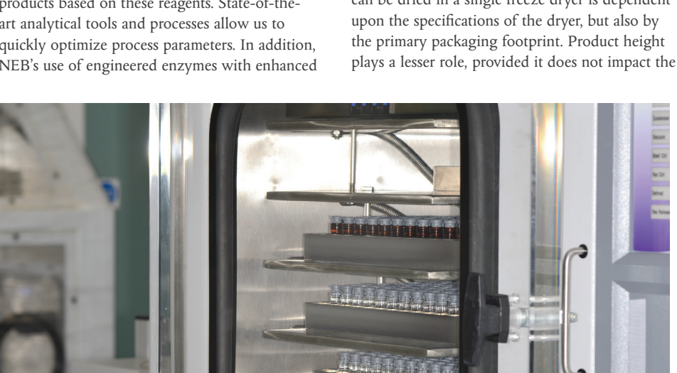
A typical freeze dryer

As noted previously, the amount of material that can be dried in a single freeze dryer is dependent the primary packaging footprint. Product height