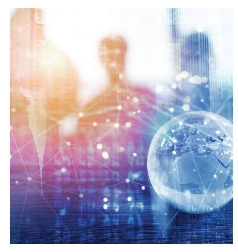
Environmentally Friendly Global Distribution: Lyophilized products are not constrained by supply logistics.

Our team can provide a variety of materials and biologics to meet functional and cost requirements for each custom project. We can manage the supply chain for your enzymes and other components as needed. Custom products may draw on the NEB portfolio of enzymes and biologics and the combined expertise across our organizations to provide your specification lyophilized from a single provider.