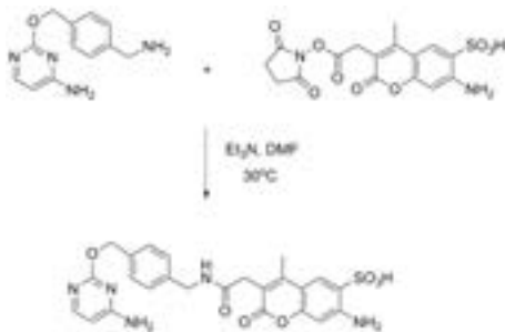
Figure 2. Coupling of BC-NH 2 to Alexa Fluor® 350 NHS ester. A solution of 2.4 mg (5.8 μmol) Alexa 350 NHS-ester in 500 μl DMF was added to 2.0 mg (8.7 μmol) BC-NH 2 and 1.2 μl triethylamine (8.7 μmol) in 500 μl DMF. The reaction was shaken at 30°C overnight. The solvent was evaporated under vacuum. The reaction was diluted in 1 ml water / acetonitrile (9:1) and the product purified by reverse phase HPLC.