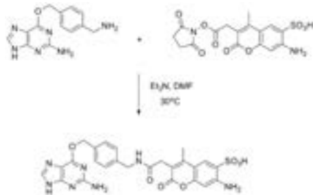
Figure 2. Coupling of BG-NH 2 to Alexa Fluor® 350 NHS ester. A solution of 2.0 mg (4.9 μmol) Alexa 350 NHS-ester in 500 μl DMF was added to 2.0 mg (7.4 μmol) BG-NH 2 and 1.1 μl triethylamine (7.9 μmol) in 500 μl DMF. The reaction was shaken at 30°C overnight. The solvent was evaporated under vacuum. The reaction was diluted in 1 ml water/acetonitrile (9:1) and the product purified by reverse phase HPLC.

The purification strategy will depend on the label used and the reaction scale. Good results have been obtained with both HPLC and silica gel chromatography.